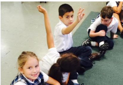
First Graders have all the answers!

“The mission of Holy Family Catholic School is to nurture Christ-like behavior in one another.”