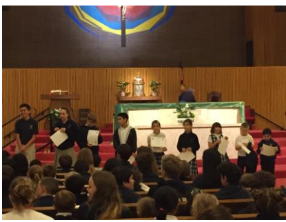
Character Counts for January Punctuality

“The mission of Holy Family Catholic School is to nurture Christ-like behavior in one another.”