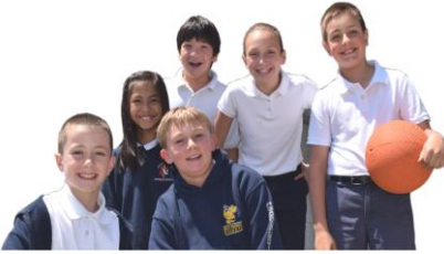
Happy HFCS Students!

THANK YOU to everyone that donated to their class projects and the Auction baskets. THANK YOU to all of our families and friends that attended the Auction and help make our biggest fundraiser of the year a success.