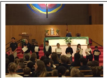
Character Counts for January Punctuality

“The mission of Holy Family Catholic School is to nurture Christ-like behavior in one another.”