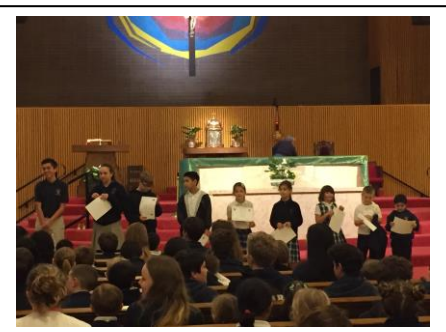
Character Counts for January Punctuality

“The mission of Holy Family Catholic School is to nurture Christ-like behavior in one another.”