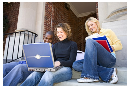
Charter Connections Academy 9-12 A California Educational Options Best Practices Program

The small campus, outstanding student body, individual meetings with teachers, core classes, and online learning options allow students to quickly show academic progress. Students begin with a 1-on-1 review of grades, credits, and goals so that an effective, individualized learning plan is created.