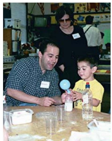
The Mejia family enjoy Science Night

Last year's Kindergarten program concluded with another successful Science Night. Students welcomed (continued on page 3)