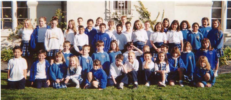
Mount Carmel's Next Generation Students