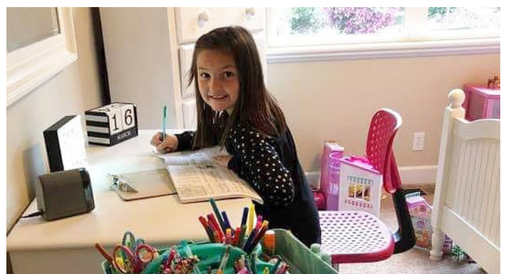
A SJCS student settles into her new routine with the launch of distance learning program.